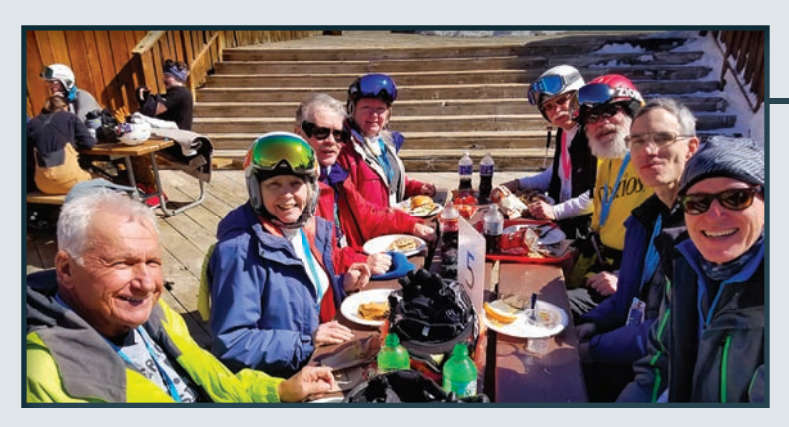
16 🛠 SKI & RIDE CLUB GUIDE - skiCMSC.com

The Boeing Employees Ski Club is a private organization, first incorporated in 1962, for Boeing employees and their families in the Saint Louis region. During the non-skiing season, the club hosts baseball games, golf outings, whitewater rafting, bike rides, and two large club social events for the pre and post ski season. The club typically plans 4 or 5 ski trips each year (2 weekend, 2 week, and 1 local midwest). besc-stl.org