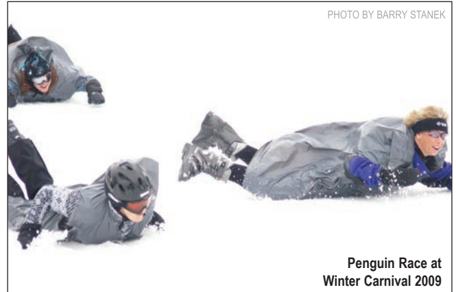
Penguin Race at Winter Carnival 2009

Costumes brought out Col. Sanders, Marie Antoinette and a Two Dollar Bill. Seems those Famous Dead People were pretty popular! We also had some scantily clad