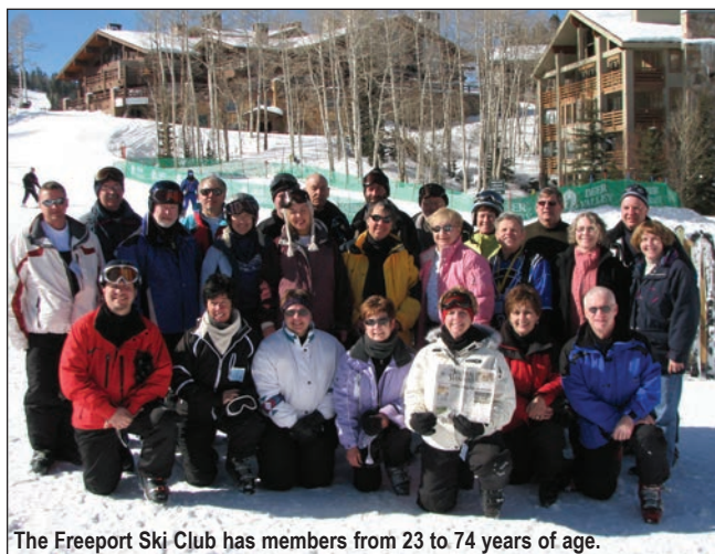
The Freeport Ski Club has members from 23 to 74 years of age.

Our main focus is downhill skiing and snowboarding, and we organize a variety of trips during the ski season to resorts in the Western U.S., Canada, Europe and the Midwest. Other winter activities include curling and cross country skiing. Summer activities include whitewater rafting, golf, rollerblading, canoeing/kayaking and bicycle tours as well festivals and shows. We are a diverse group of people who share a common desire for friendship and the great outdoors. Our membership represents all ages and backgrounds. Contact: www.bnski.org .