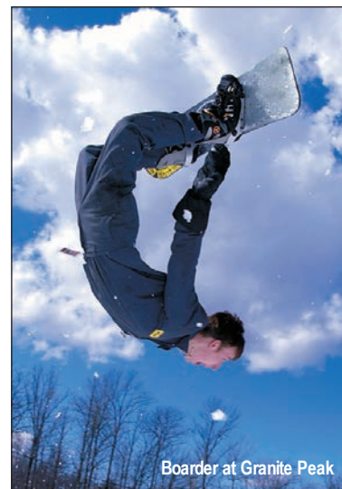
Boarder at Granite Peak

The remodeled Historic Stone Chalet at Granite Peak , at Rib Mountain State Park near Wausau, features a new upstairs lounge area with mountain views, two stone fireplaces and weekly entertainment. The chalet also has additional downstairs eating, plus new changing areas and restrooms. Also new at Granite Peak is the large outdoor patio with a fire ring and an outdoor grill serving bratwurst on Saturday nights and holidays. A second high-speed lift is planned for 2009-2010, with ski-in/ski-out resort lodging planned for 2010-2012. Contact: 715-845-2846, skigranitepeak.com.