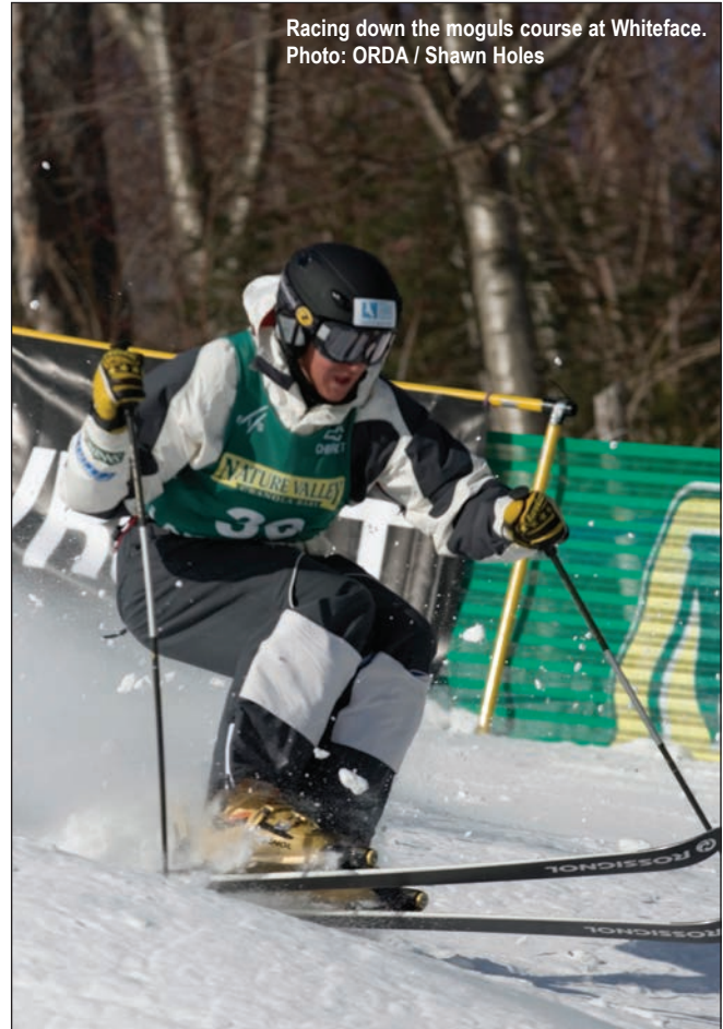
Racing down the moguls course at Whiteface.

A big draw at Whiteface is the 1980 Olympic Sports Complex. Visitors can take a ride on a bobsled with a professional driver and brakeman. The complex has 31 miles of trails for cross country skiing and snowshoeing. It has two skating rinks, including an outdoor speed-skating oval and a biathlon range.