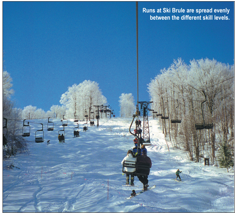
Runs at Ski Brule are spread evenly between the different skill levels.

Located in the Upper Peninsula of Michigan, Brule features over 200 miles of snowmobile trails and 33 kilometers of snowshoe and cross country ski trails. The wooded terrain of the Brule River Valley offers beginner, intermediate and advanced trails for cross country skiers. Nordic skis and snowshoes are available to rent. Snowmobilers can easily