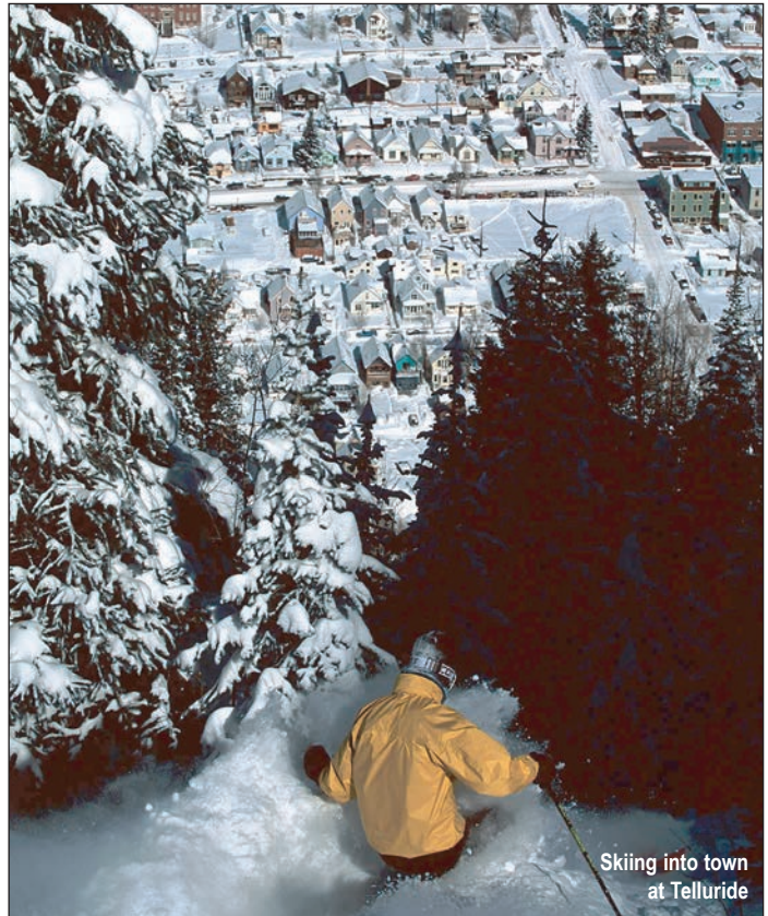
Skiing into town at Telluride

Telluride Ski Resort recently unveiled its Revelation Bowl and Lift on the east side of Gold Hill. The bowl is for advanced and expert skiers and riders and offers a vertical drop that is now one of the largest in North America, at 4,425 feet with 3,845 vertical feet lift-served. Along with a 400-acre expansion this year, there is a new Bear Creek Continued on page 22